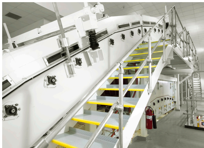
Roll support dryer

Dürr understands the importance of applying the optimum nozzle design and configuration to meet process requirements. This technology is the control of drying rates that do not disturb the coating, coupled with the knowledge and experience of web handling, that puts it at the leading edge.